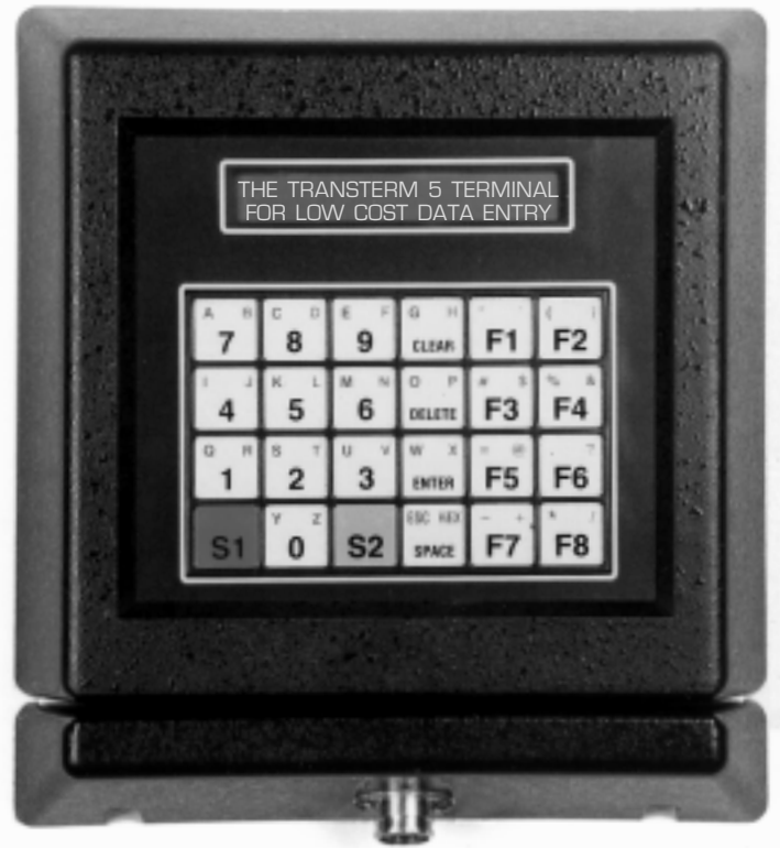
Wall Mount Model