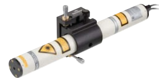
ULM-TILT with laser