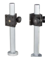
Rods and Rod Clamps (see page 994)