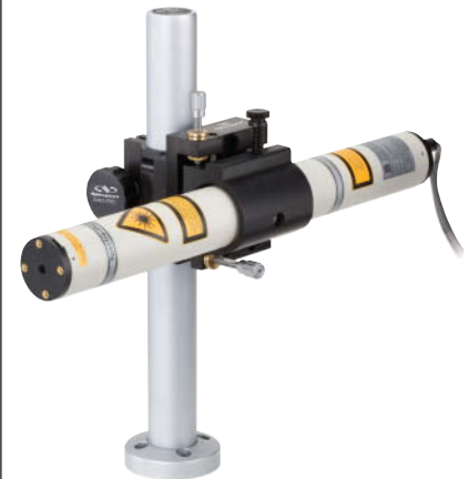
Cylindrical Laser Mount assembly with Rod and Rod Clamp