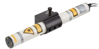
ULM with laser