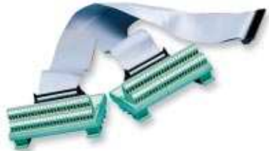
Figure 7. B-100 I/O Connector Kit

CB-100 with 1 m R1005050 cable .....777812-01 CB-100 with 1 m NB5 cable.....776455-02