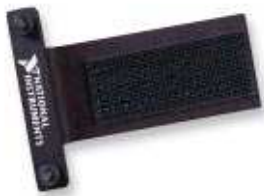
Figure 14. PCMCIA Strain-Relief Accessory