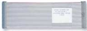
Figure 11. NB1 Cable