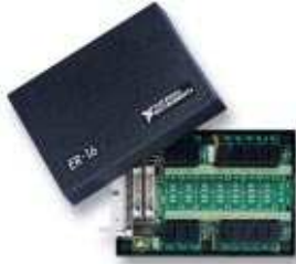
Figure 2. Digital Signal Conditioning Accessories