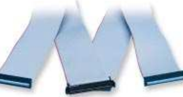
Figure 12. NB5 Cable