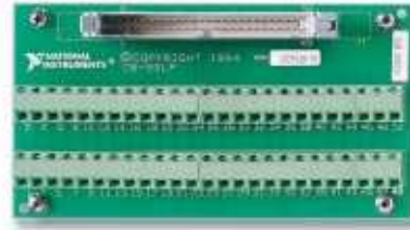
Figure 6. CB-50LP I/O Connector Block

CB-50LP.....777101-01 Dimensions □13.26 by 7.19 cm (5.22 by 2.83 in.)