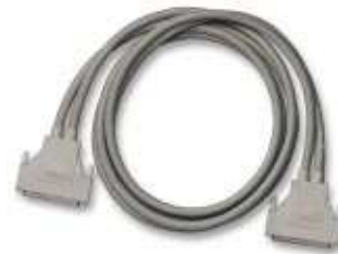
Figure 9. SH100-100-F Shielded Cable