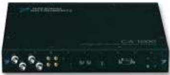
Figure 3. CA-1000 Configurable Signal Connectivity Solution