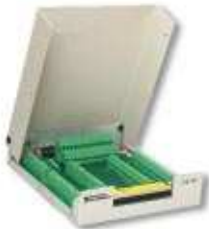
Figure 4. SCB-100 Shielded Connector Blocks