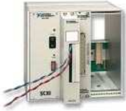
Figure 1. SCXI High-Performance Signal Conditioning