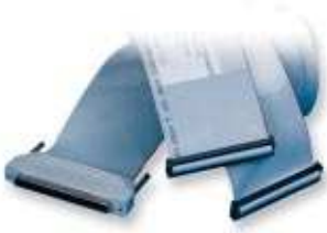
Figure 10. R1005050 Ribbon Cable