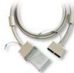
Figure 8. H50-50 Shielded Cable

2 boards .....776249-02 3 boards .....776249-03 4 boards .....776249-04 5 boards .....776249-05 Extended, 5 boards .....777562-05