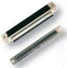
Figure 13. PCB Mounting Connectors