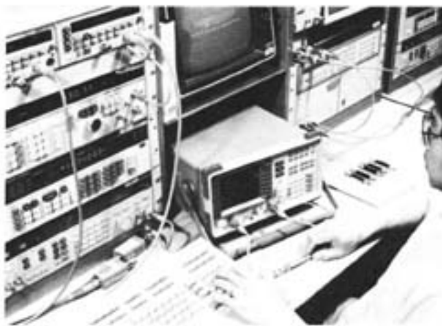
HP 8590 series RF spectrum analyzers have built-in tracking generator option