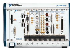
Figure 1. This NI PXIe-8106 controls an 8-slot PXI Express modular instrument and data acquisition system.

NI 8106 embedded controllers deliver a performance improvement of up to 100 percent compared to systems and instruments running traditional single-core processors and up to 46 percent for LabVIEW applications compared to the NI 8105 embedded controllers and other systems using an Intel Core Duo processor, Intel's previous-generation dual-core architecture. Using SYSmark benchmarking software, NI 8106 controllers demonstrate an overall performance improvement of 29 percent compared to NI 8105 controllers.