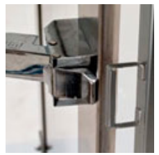
Now with all-304/316 stainless steel latches to eliminate scratching, corrosion and contamination common with plated hardware.