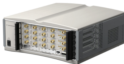
U1056B Data converter system

For creation of an integrated Compact PCI system, including chassis, interface or single board computer, please refer to the U1056B product.