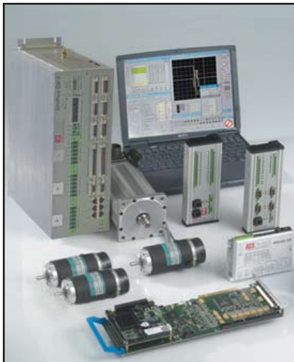
SPiiPlus CM is part of the SPiiPlus line of motion control products & software tools