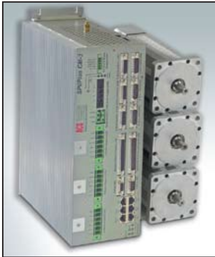
SPiiPlus CM-3 comprehensive motion control solution for three axes