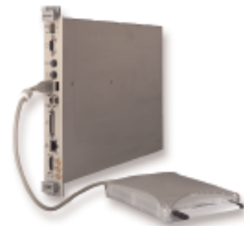
Figure 2. USB Floppy Drive

National Instruments also offers an optional external USB floppy drive for use with the VXIpc-77x embedded controllers (see Figure 2). The floppy drive connects directly through USB and requires no external power. This USB floppy drive is an excellent option for easy software installation or read/write data storage access on a floppy diskette.