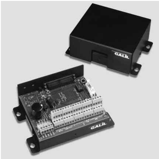
ICM-1460 Interconnect Module (shown with and without cover)

For applications requiring optoisolation, the ICM-1460 "OPTO" option provides 5–24 V optoisolation on all general inputs and outputs, home inputs, limits, and abort input.