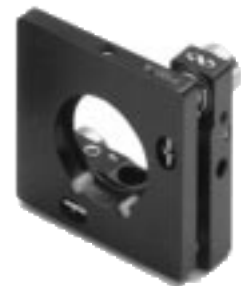
P100-A-H (Hex Head Version)

Newport's PERFORMA Series are stable cost-effective mounts, ideal for OEM Optical Systems. Call us with your custom requirements.