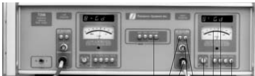
T206 Dual Channel Flowmeter (front panel)

T106 single channel 10 lbs (4.5 Kg), 8 1/2" w x 5" h x 16" d (90-130 Volts; 50-60Hz, single phase (30 VA, 1.0 AMP slow-blow fuse); 200-260 Volts; 50-60Hz, single phase (30VA, 0.4 AMP slow-blow fuse) T206 dual channel 16 lbs. (7.2 Kg), 19" w x 5" h x 16" d 90-130 Volts; 50-60Hz, single phase (60 VA, 1.6 AMP slow-blow fuse); 200-260 Volts; 50-60Hz, single phase (60VA, 0.8 AMP slow-blow fuse) T106U/T206U single channel and dual channel model with data acquisition and pressure recording capability. Includes: • Computer Interface circuitry , cable, and "WINDAQ" software to connect the flowmeter to an IBM compatible computer via its serial RS232 port; • Pressure sensor amplification by flowmeter A/D board for acquisition of pressure data in addition to flow. RJ11 phone input jack for pressure transducers; 1 per flow channel. Synchronization for multi-unit operation or simultaneous use with Doppler instrument is supplied as standard circuitry on all units. Gating (-G) Option for use during MRI unit to eliminate cross- coupling interferences. Bubble Alarm (-B) Option with audible alarm which sounds when gas bubbles pass through a sterile tubing flowsensor.