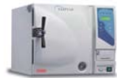
Pre & post vacuum tabletop sterilizers designed to perform class B cycles