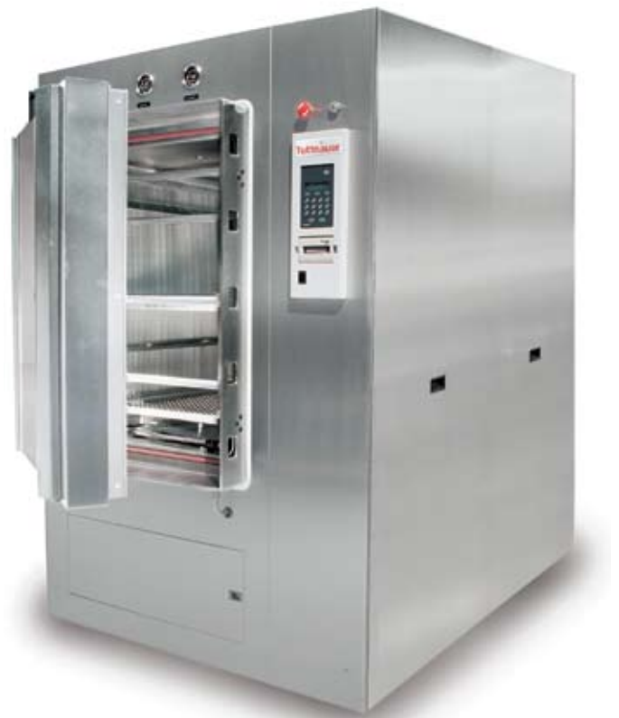
Automatic Hinged Door