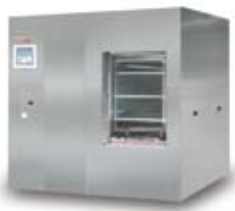
T-Max Line of Large Sterilizers complies to the DIN 58 946 Standard

Featuring Tuttnauer's range of cleaning, disinfection and sterilization solutions