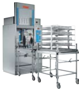
Washer disinfectors for hospitals and laboratories