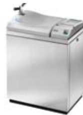
Laboratory autoclaves ranging in size and application