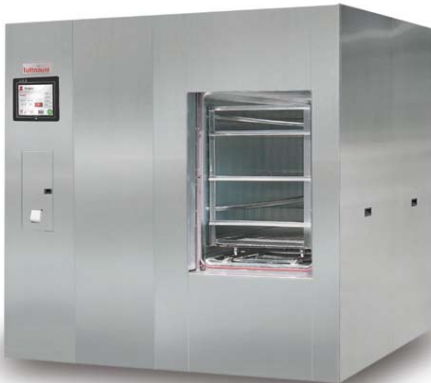
Horizontal Sliding Door