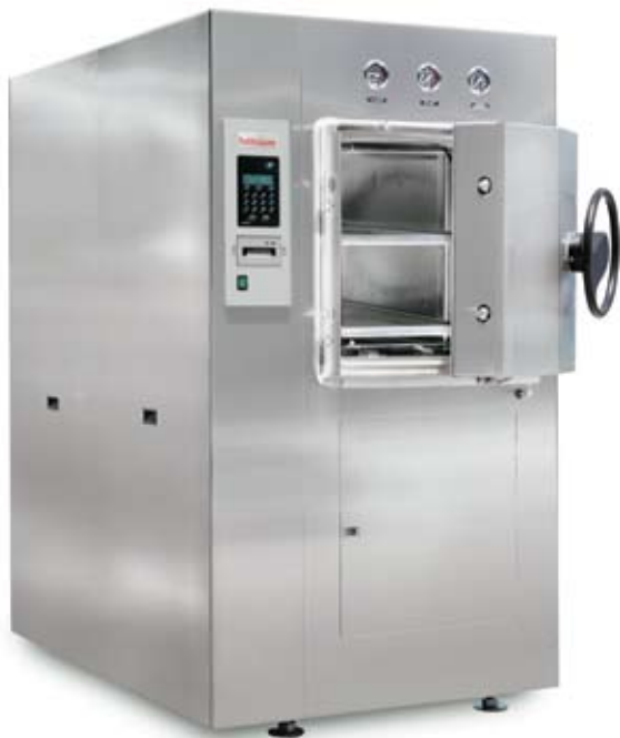
Manual Hinged Door