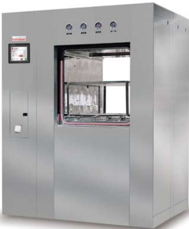
Vertical Sliding Door