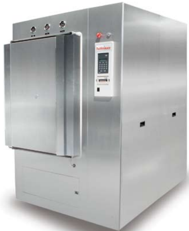
Automatic Hinged Door