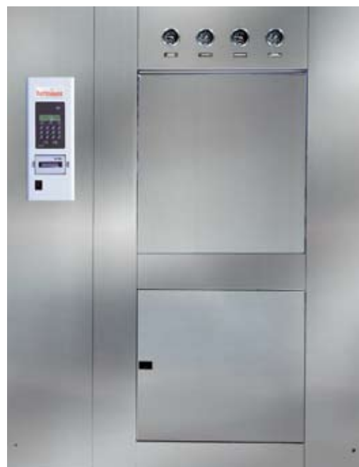
Vertical Sliding Door