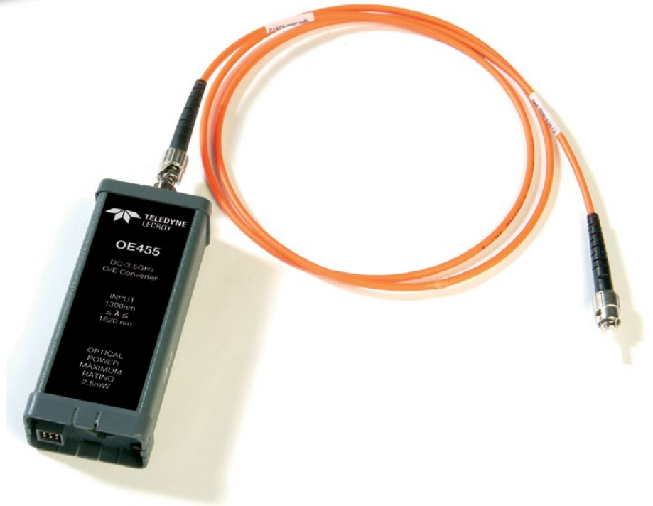
OE455 optical-to-electrical converter shown with multi-mode fiber jumper attached.

Teledyne LeCroy's wide-band multi-mode optical-to-electrical converters are designed for measuring optical communications signals. Their broad wavelength range and multi-mode input optics make these devices ideal for applications including Gigabit Ethernet and Fibre Channel, as well as SONET/SDH up to 2.5 Gb/s.