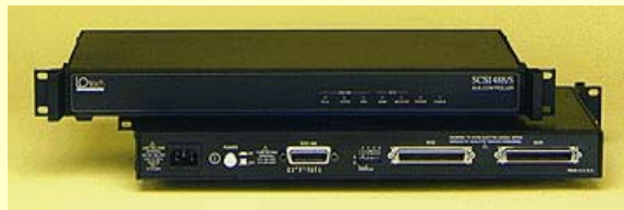
SCSI488/S brings IEEE 488 control to SPARCstations via the SCSI port