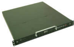
DM4 Storage Unit