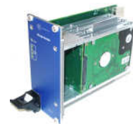
DM-425-3U Storage Unit