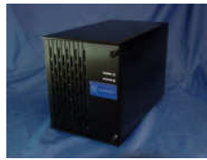
DM4E Storage Unit