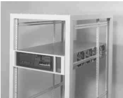
VSS-11/Model 30, rack mounted with optional CSN-x slides

In the rack mounted configuration these chassis require only 5¼" of vertical rack space to hold all of the basic components of a SUN-compatible system. The VSS-11/Model 30 houses up to 5 9U x 400mm card slots, one or two 5¼" full height drives, up to 700W of system power plus cooling, control panel and internal power distribution in only 31" of rack depth. The VCS-11/Model 20 provides the same capability, except for the drive bays, in only 25½" of rack depth.