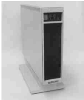
VCS-11/Model 20, in optional VSV-11/TOWER KIT