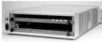
VCS-11/Model 20, rear view