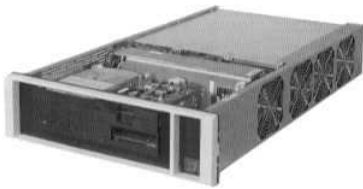
VSS-11/Model 30, interior Note space for mass storage