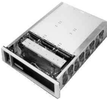
VCS-11/Model 20, interior