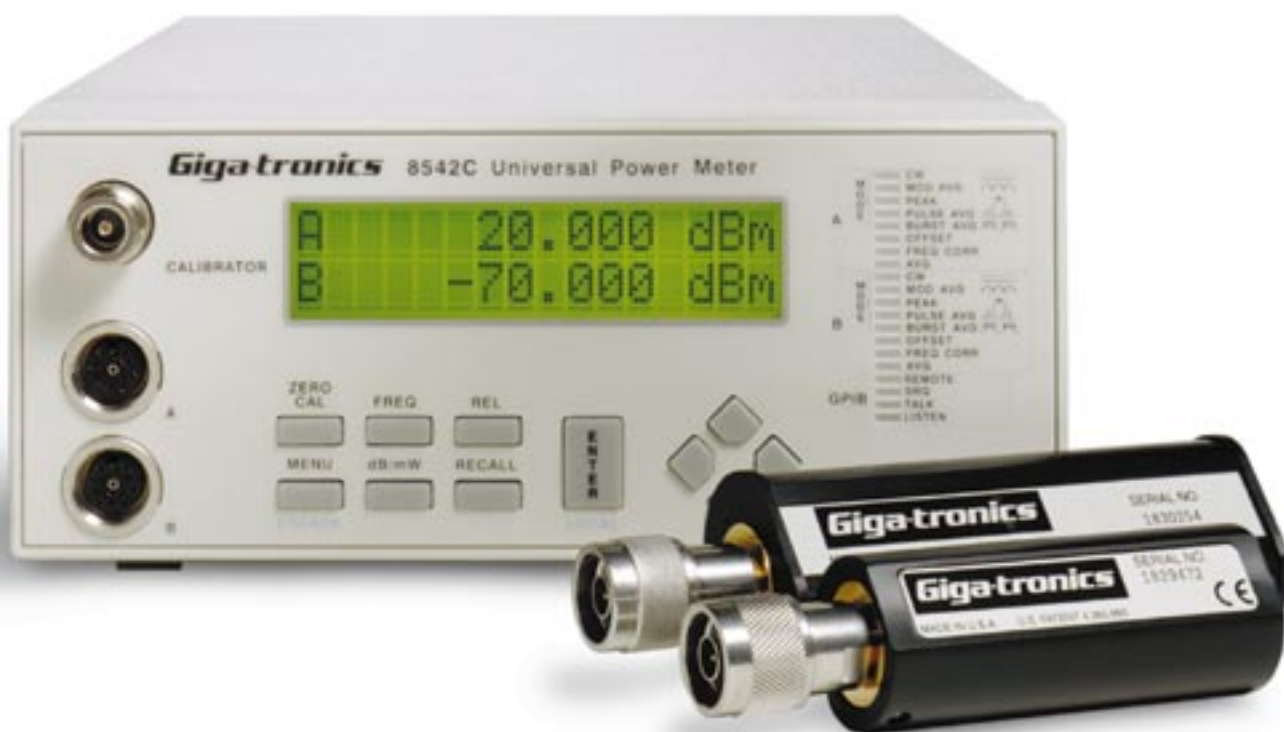
The Giga-tronics 8540C Series combines the speed, range, and capabilities needed to test today's sophisticated communications systems.

The exclusive Time Gating feature of the 8540C lets you program a measurement start time and duration to measure the average power during a specific time slot of a burst signal. This is critical for accurately measuring the average power of GSM, NADC and