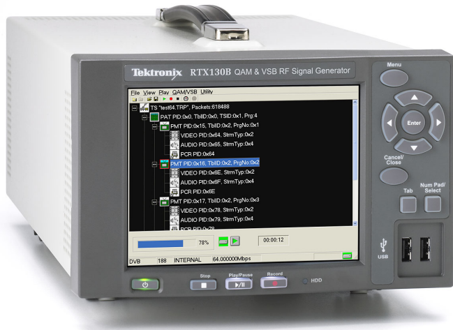
RTX130B MPEG RF Signal Generator