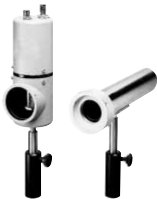
Photomultiplier Tubes in Side-on and End-on Housings

Photomultiplier tubes (PMTs) offer a most cost effective, low light level measurement solution. Because the permutations are many, we don't offer complete PMT systems for the Oriel OPM™, but rather offer the components so you can "build" your own system. Here, we give you an overview of the PMT family, and offer guidance in choosing the components.