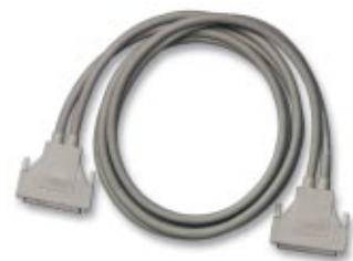
Figure 9. SH100-100-F Shielded Cable