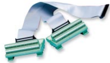
Figure 7. B-100 I/O Connector Kit

CB-100 with 1 m R1005050 cable .....777812-01 CB-100 with 1 m NB5 cable.....776455-02