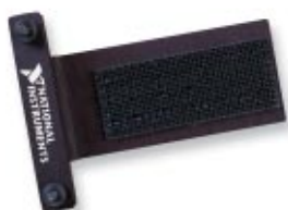
Figure 14. PCMCIA Strain-Relief Accessory