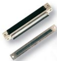
Figure 13. PCB Mounting Connectors