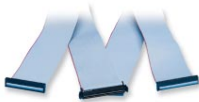
Figure 12. NB5 Cable