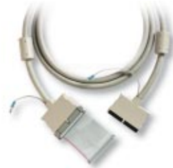
Figure 8. H50-50 Shielded Cable

2 boards .....776249-02 3 boards .....776249-03 4 boards .....776249-04 5 boards .....776249-05 Extended, 5 boards .....777562-05