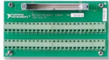
Figure 6. CB-50LP I/O Connector Block

CB-50LP.....777101-01 Dimensions – 13.26 by 7.19 cm (5.22 by 2.83 in.)