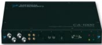
Figure 3. CA-1000 Configurable Signal Connectivity Solution