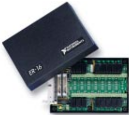
Figure 2. Digital Signal Conditioning Accessories