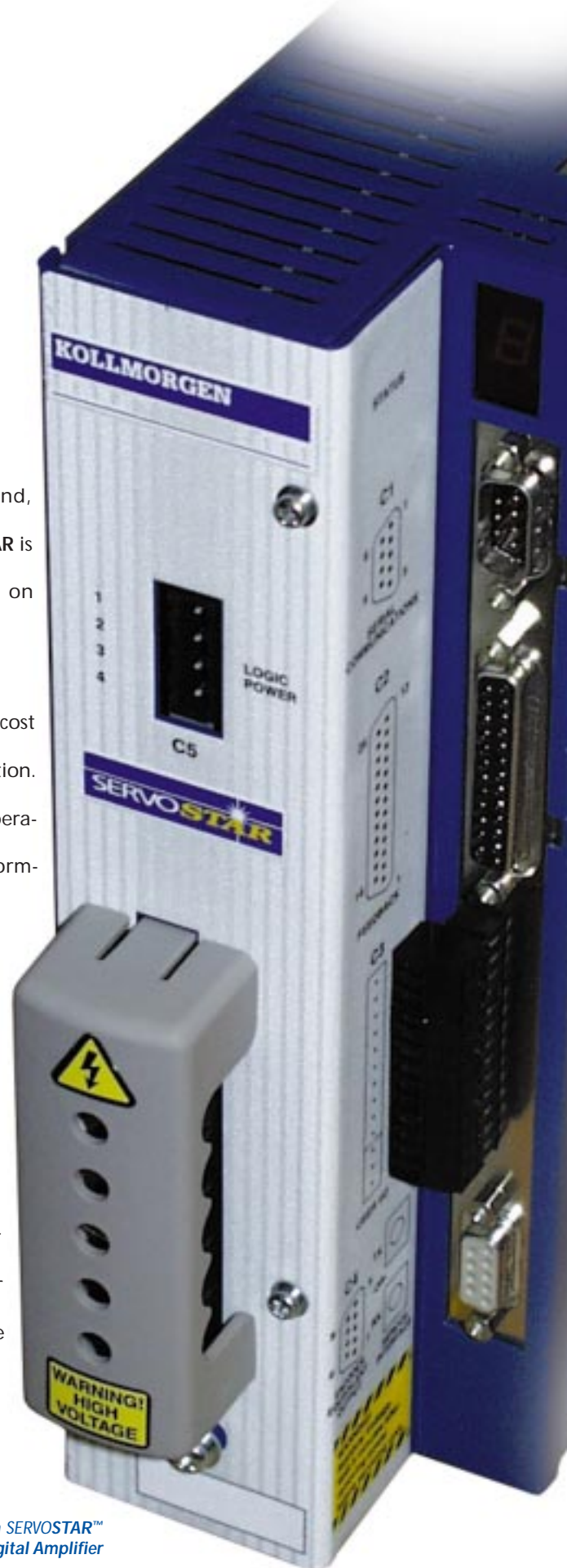
Kollmorgen SERVOSTAR™ S-Series Digital Amplifier

To complement SERVOSTAR, Kollmorgen offers the world's broadest range of precision servomotor products to help you maximize overall speed, accuracy and reliability, while virtually eliminating interoperability problems. Together, you get universal motion control solutions that feature Kollmorgen's renowned quality, global service and experienced support. A combination that promises better performance at a lower cost. That's what value is all about. Optimize the performance of your motion control system with SERVOSTAR and Kollmorgen's complete family of precision, brushless servomotor products.