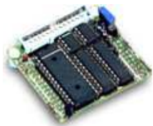
DCX-MC100 Module (± 10 volt analog command)