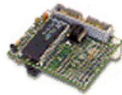
DCX-MC120 Module (PWM output, TTL)