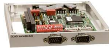
Rugged IDAN configuration available