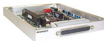
Rugged IDAN configurations available