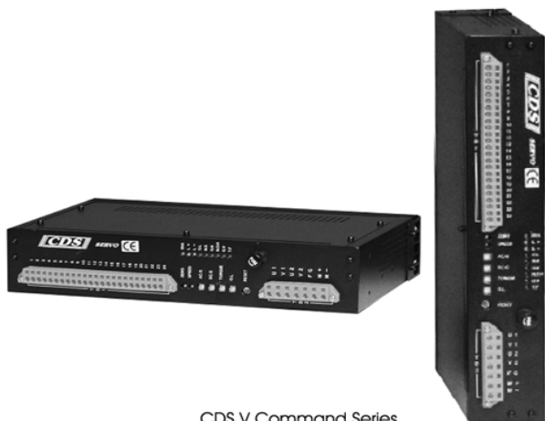
CDS V Command Series

CDS Servo Amplifiers are used on HH Roberts, Topwell, and AnnYang CNC lathes, CNC mills and machining centers.