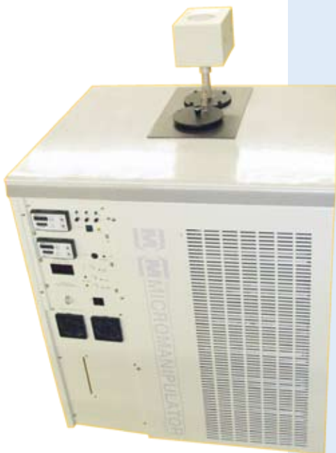
HC1000 -55 / -65 deg chiller