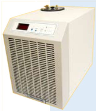
C1000 Zero deg chillerr