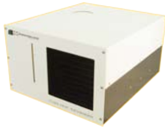
C1000 Heat Exchanger