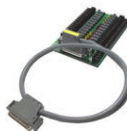
"D" with CA-3710