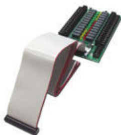
Non-"D" with CA-5015