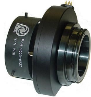
Fig. 1 #24 Olympus Type Microscope Mount Set