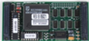
Artisan Technology Group