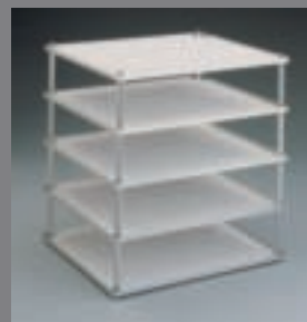
Five-Tier Blood Bag Platform Cat. No. 3523-51