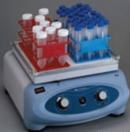
MaxQ 2508 Shaker Cat. No. SHKA2508