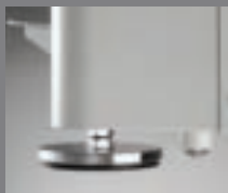
Retractable foot casters allow easy manipulation in lab.