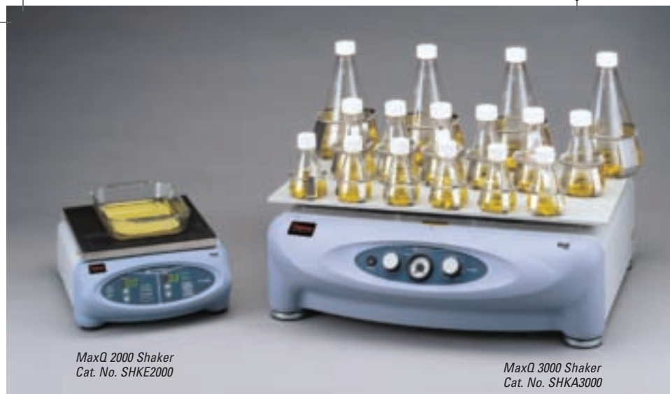
MaxQ 2000 Shaker Cat. No. SHKE2000