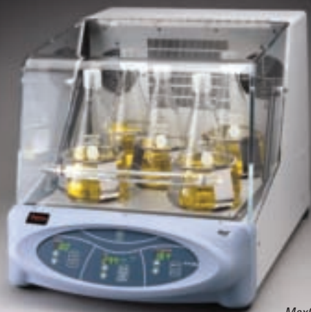
MaxQ 4000 Shaker Cat. No. SHKE4000