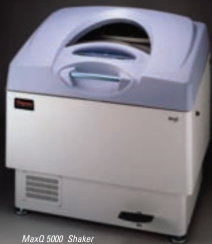
MaxQ 5000 Shaker Cat. No. SHKE5000