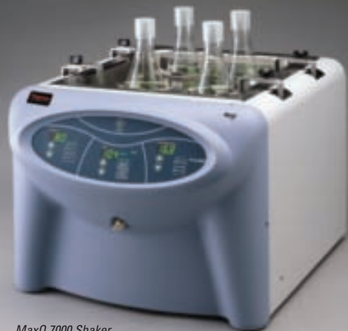
MaxQ 7000 Shaker Cat. No. SHKE7000