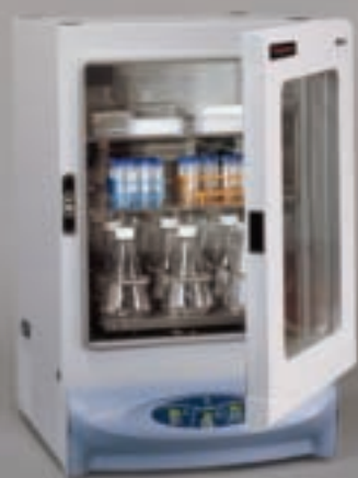
MaxQ 6000 Shaker Cat. No. SHKE6000