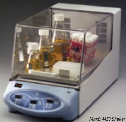
MaxQ 4450 Shaker Cat. No. SHKE4450