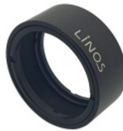
Mount CL 25.4 (G063663000)