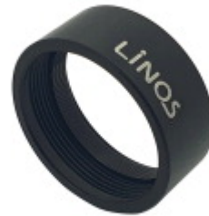
Mount CL 22.4 (G063651000)

Tip: LINOS optics can be mounted before shipping. In this case, the optics designation is engraved on the mount, which can prevent confusion. Pre-mounting also protects the optics from the damage that can occur when switching lenses in a mount.