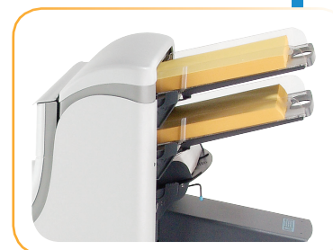
2 sheet feeders and 1 insert/BRE feeder