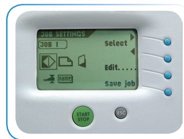
User-friendly control panel

* Paper & envelope specifications may vary. All media must be tested.