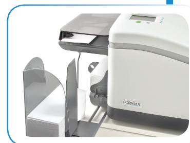
Side exit tray