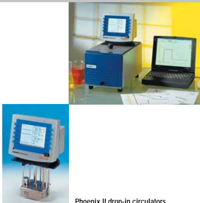
Phoenix II drop-in circulators

Drop-in circulators for general purpose applications