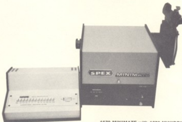
1670 MINIMATE with 1673 MINIDRIVE stepper-motor control, and 1674 CAMERA ADAPTER holding 1628 POLAROID FILM BACK