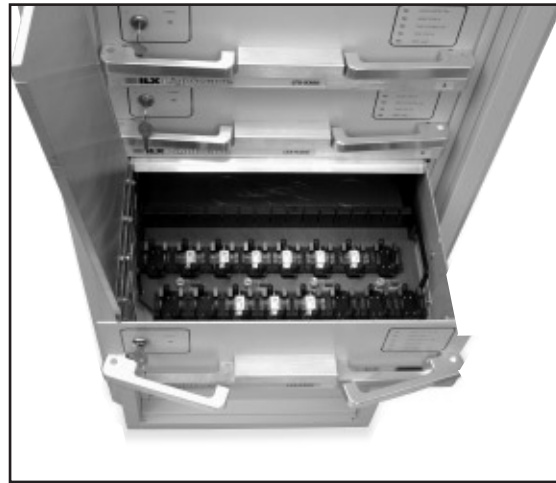
Convenient pull-out drawers makes DUT loading and removal easy.

For high-density burn-in applications, all eight slots can be loaded with four-channel current source boards for a total of 32 independent laser current sources.