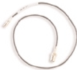
Figure 4. SMB 100 Cable