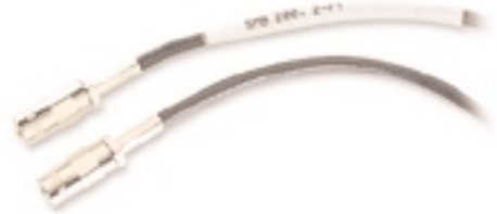
Figure 6. SMB 200 Cable