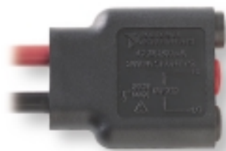
Figure 9. Current Shunt