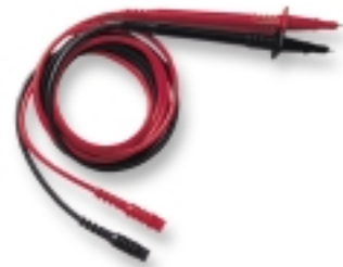
Figure 8. P-1 Probe Set