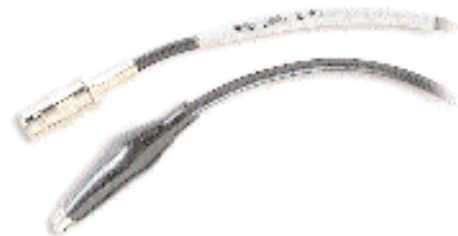
Figure 7. SMB 300 Cable