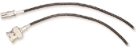
Figure 5. SMB 110 Cable