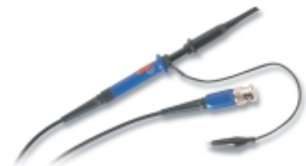
Figure 10. SP200B