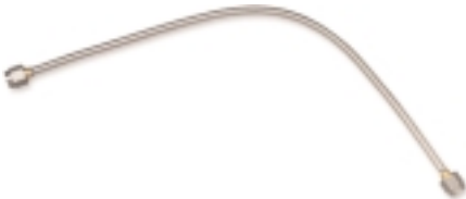
Figure 3. SMA 100 Cable