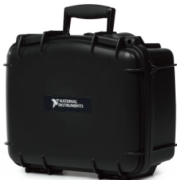
Rugged Carrying Case (780315-01)