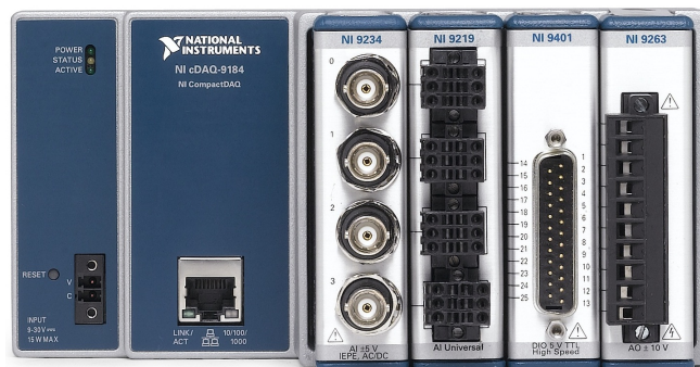
Figure 1. The NI cDAQ-9184 Ethernet chassis can hold up to four analog I/O, digital I/O, or sensor measurement modules.

Many devices can measure temperature, voltage, or bridge-based sensors, but NI CompactDAQ can integrate all of these measurements and more into a single device that outputs all of the data via the same bus interface. With an NI CompactDAQ system, you can mix multiplexed voltage input signals, simultaneously sampled accelerometers, low-speed thermocouples, and TTL digital I/O all in the same chassis using the same driver, NI-DAQmx. NI CompactDAQ makes programming easier because you use the same driver for all measurements. This solution saves space and simplifies service and support.