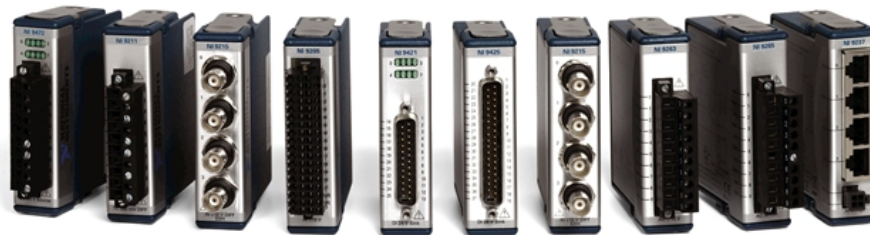
Figure 2. You can choose from more than 50 NI C Series measurement modules.

You can choose from more than 50 NI C Series modules for different measurements including thermocouple, voltage, RTD, current, resistance, strain, digital (TTL and other), accelerometers, and microphones. Each C Series module combines sensor connectivity, signal conditioning, and A/D converters into a small 2.8 by 3.5 in. package. Channel counts on the individual modules range from three to 32 channels to accommodate a wide variety of system requirements. With eight slots to fill per chassis, you can tailor each NI CompactDAQ system to your unique application needs.