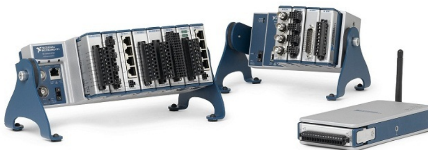
Figure 3. NI CompactDAQ Ethernet chassis use standard 10/100 Ethernet or Gigabit Ethernet connections to communicate with a host PC or laptop.

The convenience and reliability of Ethernet technology are as familiar to most as those of USB. For data acquisition, however, Ethernet offers two advantages when compared to other common PC peripheral buses: long cabling lengths and distributed infrastructure. Ethernet is ideal for taking measurements at distances beyond the 5 m limit of a USB cable. A single CAT 5E cable can reach 100 m before needing a switch or router to carry the signal farther. Furthermore, many IT departments have standardized on Gigabit Ethernet (IEEE 802.3ab) as the backbone for their corporate networks. With NI CompactDAQ, you can take advantage of that existing infrastructure and additional network bandwidth for your remote or distributed measurement applications. One host computer can manage multiple test stations within the same facility or across multiple sites.