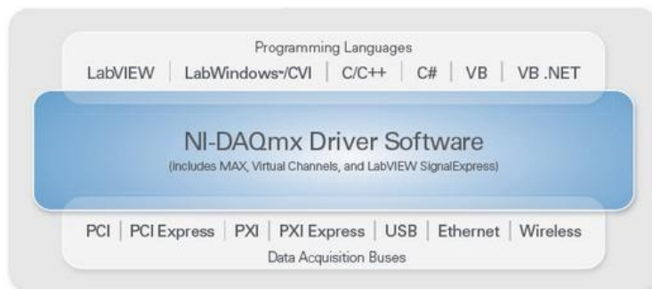
Figure 6. NI-DAQmx driver software abstracts data acquisition bus technology and provides a consistent API across multiple programming languages.

Recognizing the diversity of measurement applications, NI approaches programmatic data acquisition independently of specific PC bus technologies. You can use the same NI-DAQmx driver software to communicate with NI data acquisition hardware across PCI, PCI Express, PXI, PXI Express, USB, Ethernet, and Wi-Fi. You can use an application developed for an NI CompactDAQ USB system with an NI CompactDAQ Ethernet system without making any changes to your software. Furthermore, the NI-DAQmx API is consistent across multiple programming platforms, so you can develop an application for NI CompactDAQ in NI LabVIEW, ANSI C/C++, C#, or Microsoft Visual Basic .NET.