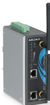
Industrial Wireless Client/Access Point/Bridge (782436-01, 782436-02, 782436-03)