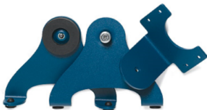
Desktop Mounting Kit (779473-01)