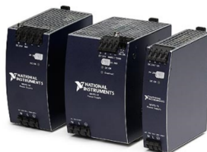
Industrial Power Supplies (781093-01, 781094-01, 781095-01)