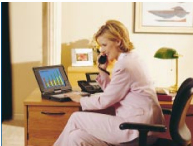
Talk and send data at the same time.

All Panasonic 7200 and 7400 series digital phones feature an extra RJ-11 jack. This "eXtra Device Port" (XDP) enables you to connect any single-line device directly to your phone, instantly expanding your connection capacity and allowing you to use both communications devices simultaneously. Plug in a cordless phone, fax machine, answering device, laptop, modem or credit card verifier. Now you're able to talk on the phone while faxing, transmitting a data file or even surfing the Net!