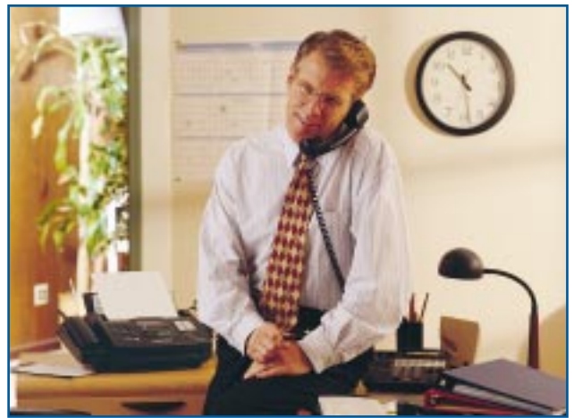
Talk while sending or receiving a fax.