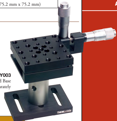
PY003 Post and Base Sold Separately