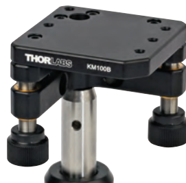
KM200P Post and Post Holder Sold Separately

Both platforms have an array of #6-32 (M4 x 0.7) tapped holes for securing PM1 or PM2 clamping arms, which are sold separately. In addition, the KM200B also has 1/4"-20 (M6 x 1.0) tapped holes for mounting other components, such as a post holder or a CR1 Rotation Stage.