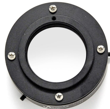
Fig. 1 #21 Zeiss Axiovert Type Microscope Mount Set