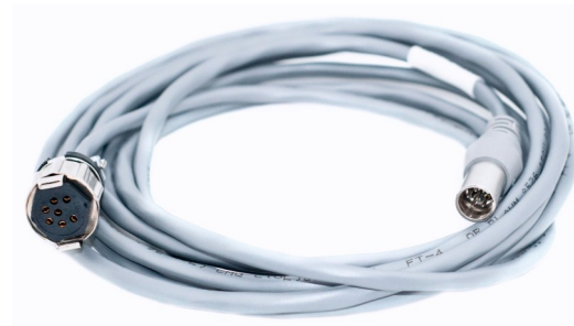
Fig. 1 710A Shutter Inter-connect Cable