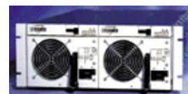
Power & Cooling