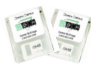
Design & Documentation