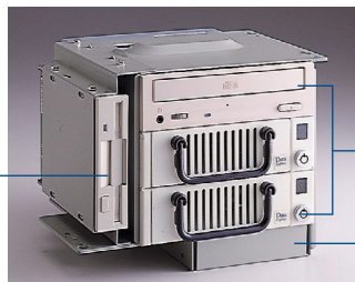
One 3.5" drive bay

Three 5.25" drive bays DVD-ROM & disk trays are not included