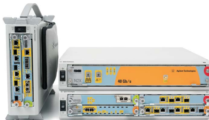
Agilent N2X chassis family