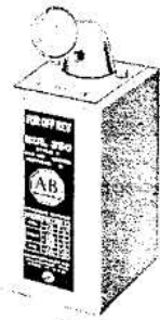
Size A Catalog Number 350-TAV32