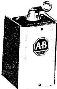
Size 1 Catalog Number 350-BAV