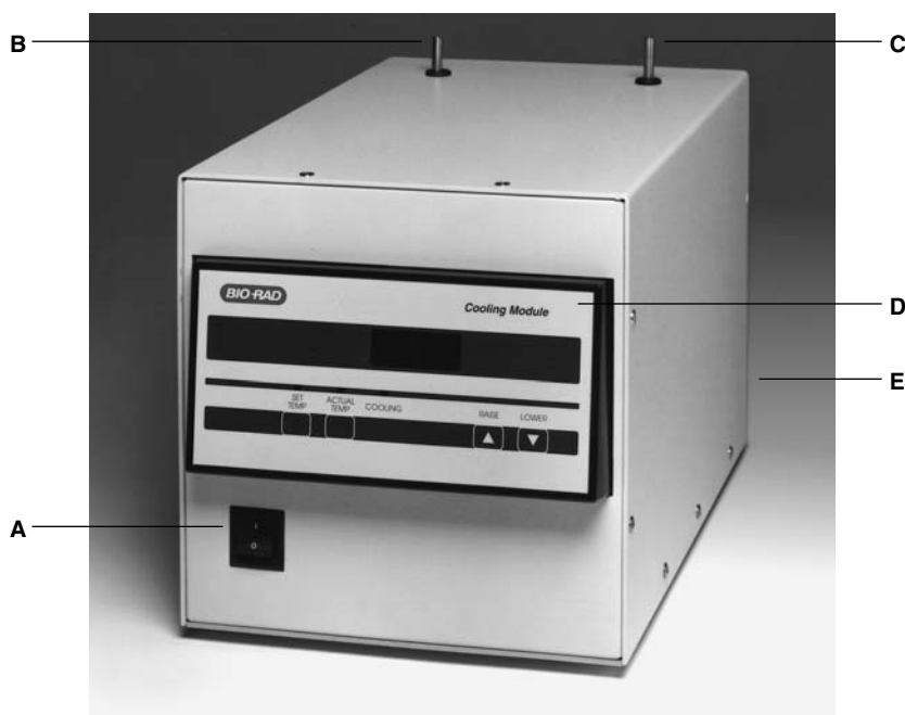
Fig. 1. Cooling Module. A. Main power switch. B. FLOW IN port. C. FLOW OUT port. D. Control panel. E. Electrophoresis chamber internal temperature probe port and fuse (back of unit).

The Cooling Module maintains a constant buffer temperature typically within 1 °C of the set temperature (after stabilization) in an operating range of 5–25 °C for a total buffer capacity of 2.2 liters at a flow rate of 1.0 liter/minute. Maximum buffer cooling capacity is 75 Watts (255 BTU) of input power at a set temperature of 14 °C