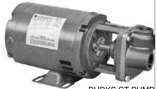
BURKS CT PUMP