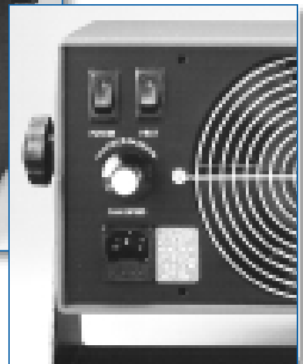
Individual heater and fan speed controls.

The Chapman VSE 3000 Volume Static Eliminator (manufactured by SIMCO) is an efficient workstation ionizer which effectively eliminates electrostatic charges quickly and reliably. The VSE 3000's variable speed fan and integral air flow diffuser floods the entire workstation with static eliminating ions for superior performance.