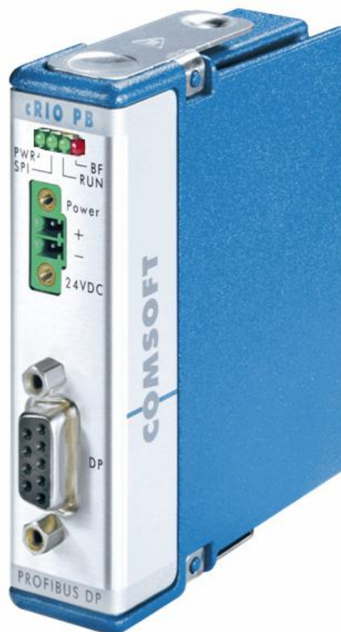
Figure 1: cRIO PB module

Important note: The CompactRIO PROFIBUS DP modules is supported only in CompactRIO reconfigurable chassis, such as an NI cRIO-911x, and NI Single-Board RIO devices.